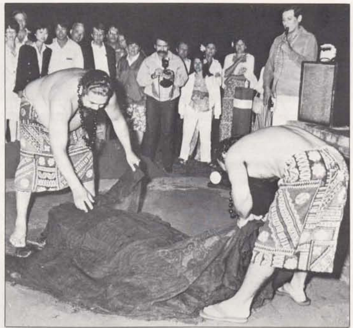
An authentic luau was a highlight.