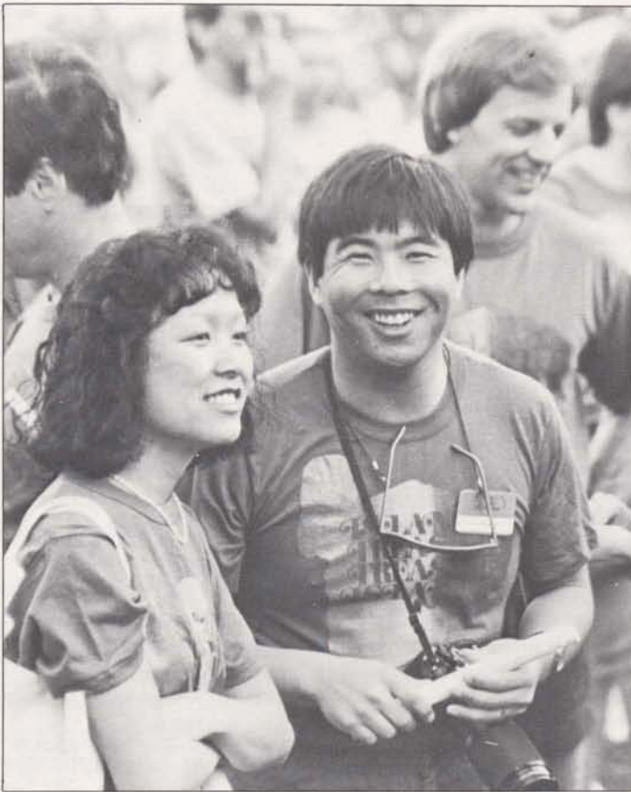
And the treasure hunt is about to begin . . .