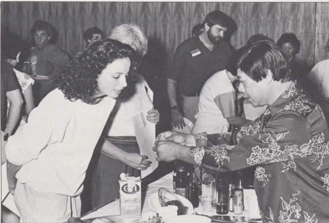
Learning the fine art of Polynesian cooking.