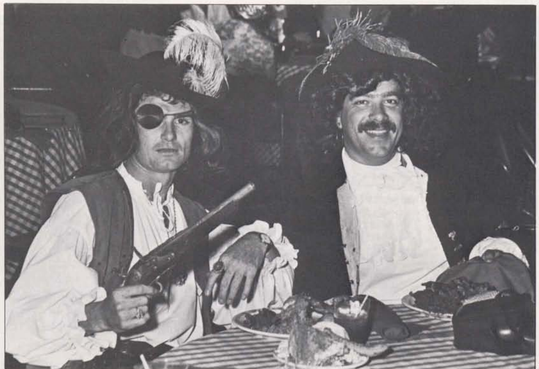
Would you want to be shipwrecked with these two?