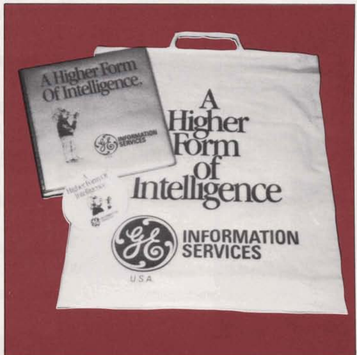
INTERFACE '85 giveaways.

Note: Almost 5,000 GE Information Services diskette cases were distributed. Twelve major client presentations have already been scheduled, and more may be in the works.