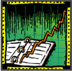
Marketing & Sales